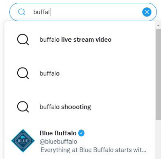
Figure 1: Partial screenshot of Twitter search bar, captured June 22, 2022 (mobile version)

However, other platforms performed even worse. For example, weeks after the attack, Twitter was “auto-suggesting” to users a search for “buffalo live stream video” after a user entered only the partial query “buffal” [sic], both on a desktop browser and on its mobile app. 119